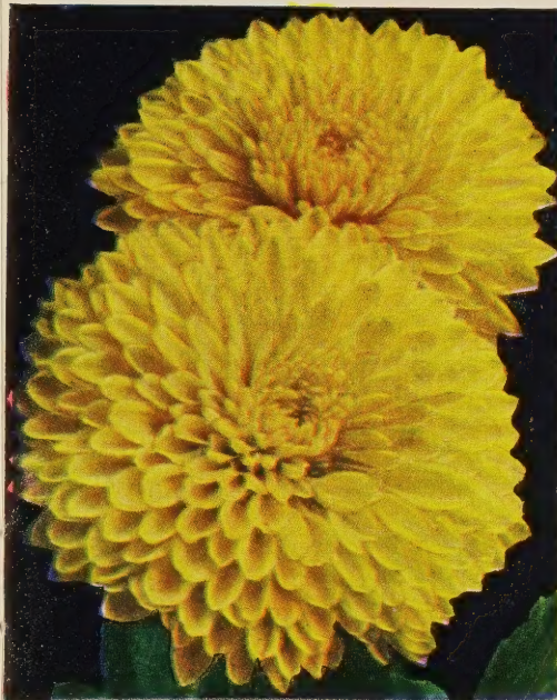
HONEYCOMB. 75c each; 3 for $2.00